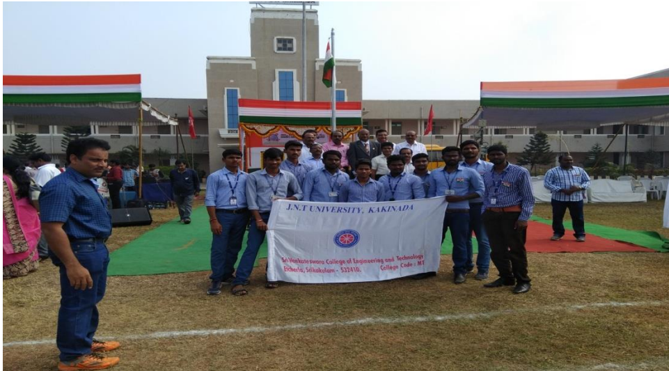
NSS Volunteers' with Honorable Vice Chancellor, JNTUK, Kakinada