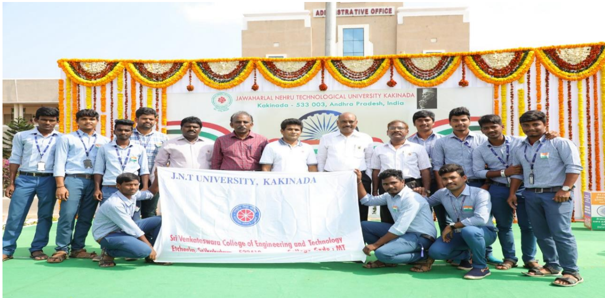
NSS Volunteers' with Honorable Vice Chancellor, JNTUK, Kakinada